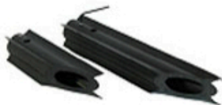
Pictured below: 8" and 12" PVC Anchors

8" WaterOrb™ has 316 stainless steel ballast with UL approved water-tight connector and under-water cable.